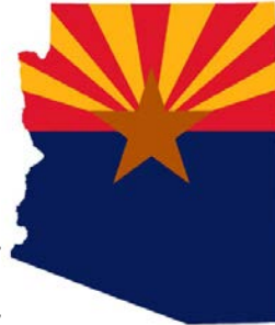
Americas - Hazardous Waste (12-month rolling)