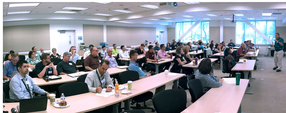
ALLIANCE and INTEL STACK TEST SEMINAR 2017

Public Responsibility and Reporting - Alliance members believe that the public and other members deserve, and hold the right, to review performance of activities conducted by the Alliance as a whole, as well as those Alliance activities conducted by individual members. Through disclosure of Alliance activity performance reports and open decision-making, the Alliance and its members are committed to promoting the highest standards of organizational integrity and public responsibility.